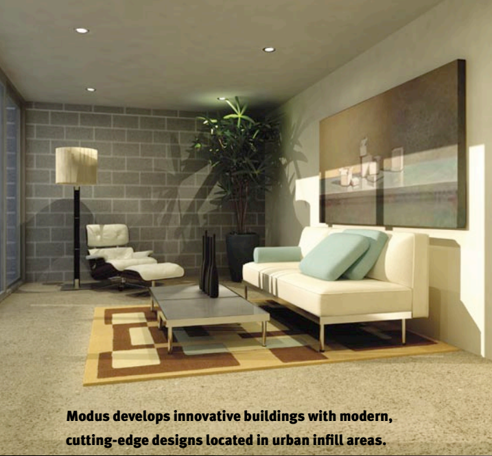
Modus develops innovative buildings with modern, cutting-edge designs located in urban infill areas.