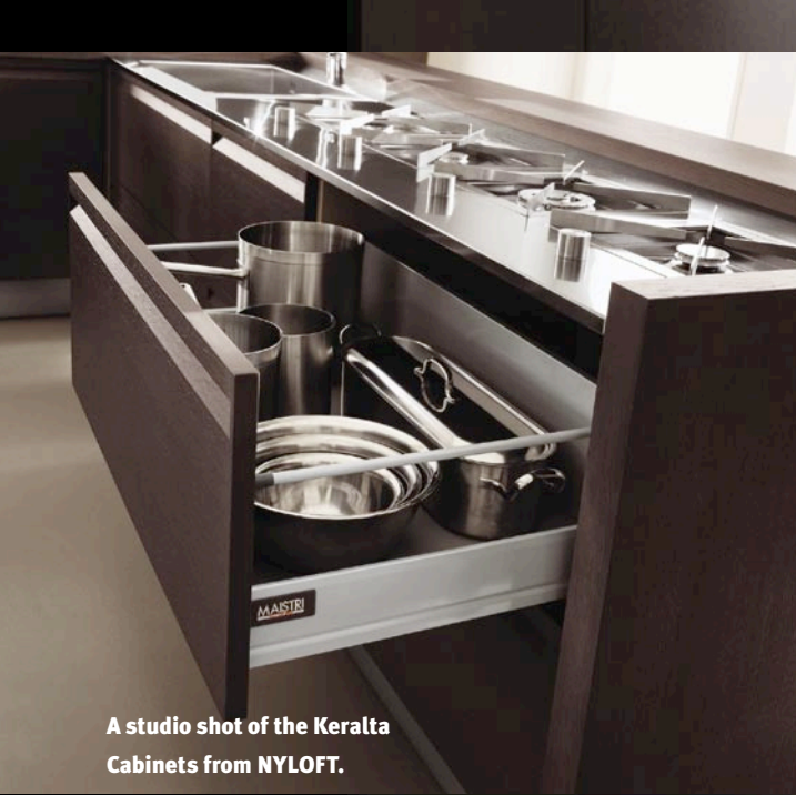
A studio shot of the Kerala Cabinets from NYLOFT.